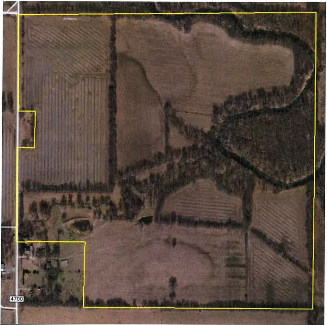
Exhibit "A-1" Boundary Exhibit